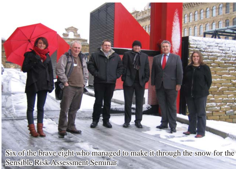
Six of the brave eight who managed to make it through the snow for the Sensible Risk Assessment Seminar

into putting a proposal together, but any proposal needs to be in line with the ethos of these organisations and not just about getting people off benefits.